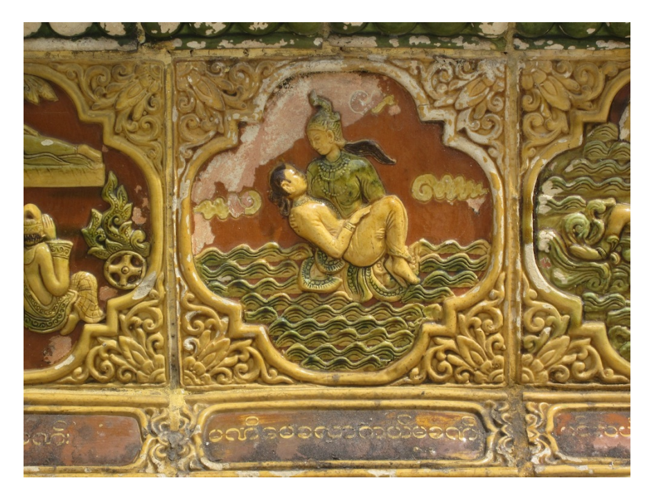
Figure 2: Glazed terracotta tile, c. 1900, Shwedagon Pagoda, Yangon (Rangoon), showing Janaka's rescue from the sea.

Richard Gombrich says, "Summaries of the Buddha's teachings rarely convey how much use he made of simile or metaphor" (Gombrich 1996: 65). Such a method is part of his pariyāya teaching. This, as Gombrich notes elsewhere, "means 'way round' and so 'indirect route' but it refers to a 'way of putting things'... pariyāya refers to metaphor, allegory, parable, any use of speech which is not to be taken literally" (Gombrich 2009: 6). As Flores notes, the "Buddha is a master of images, and he frequently speaks as a poet or parable-teller, preferring to cast his message as a lyric or a story to illustrate what could also be stated discursively" (Flores 2008: 7). The "ocean" of the Jātakas is, from the time of the canonical verses, an imaginative world that threatens monsters, demonesses, wrecks, and even gateways to hell, but also offers wealth and opportunity. Shipwrecks are frequent, as they must have been at the time, but so are the means of finding good fortune and an arena for the enactment of the Bodhisatta's search for the perfections. The kind of imagery used is found rarely in the suttas , but is prevalent in