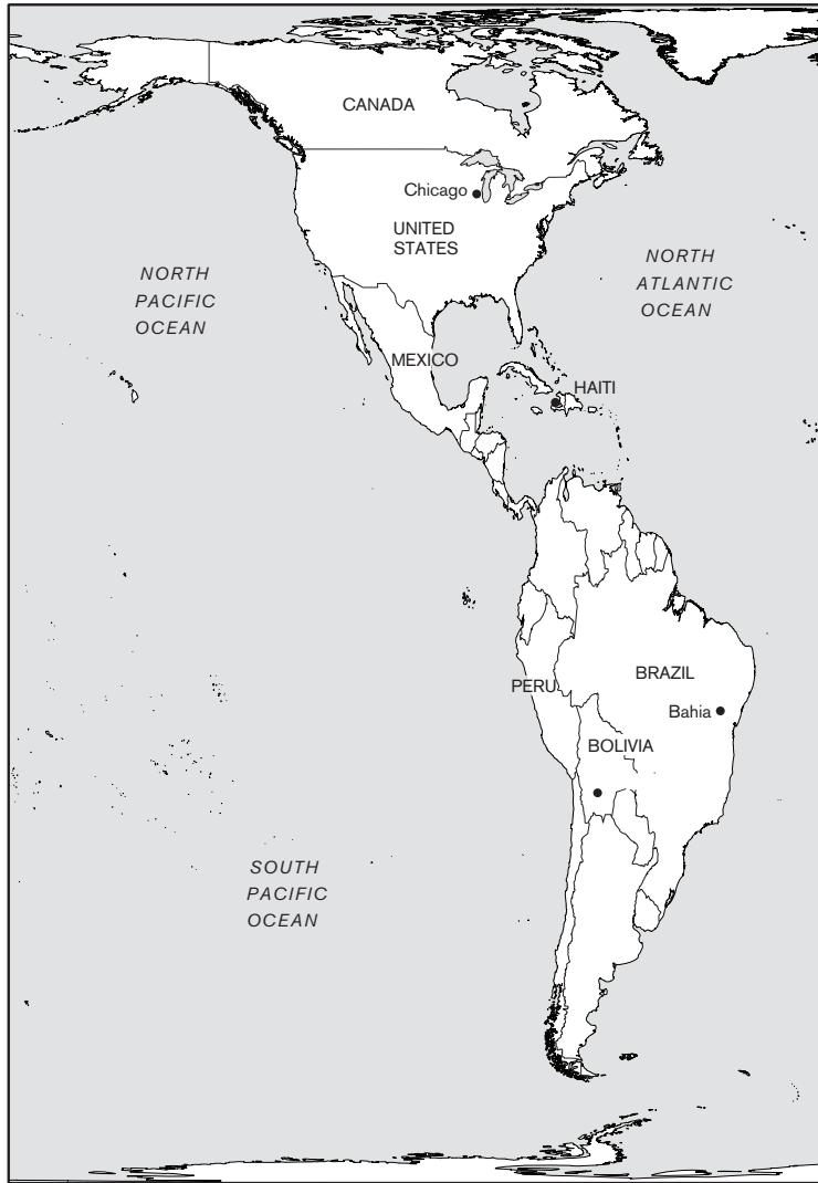
Map 1. Key locations in world-ecology, shown in the Gall-Peters projection, which distorts country shapes in order to preserve relative area sizes.