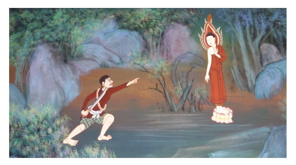
Figure 1: Angulimāla

be said about its soteriology, particularly its karma theory. This interpretation of the Aṅgulimāla Sutta , if correct, will go in some way to change that.<sup>35</sup>